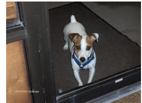
Shiloh—the Book Nook mascot!